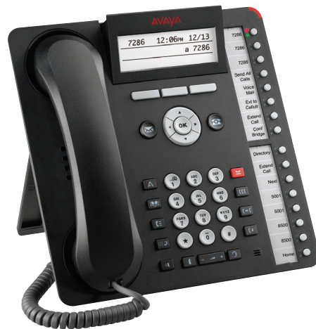
1616-I IP Deskphone

To learn more about the Avaya 1600 Series IP Deskphones, contact your Avaya Account Manager, Authorized Partner or visit avaya.com for white papers, case studies and other information showcasing Avaya solutions in action.