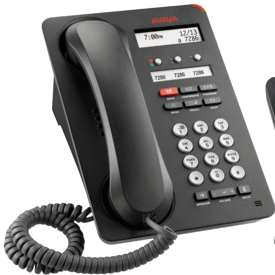
1603-I IP Deskphone 1603SW-I IP Deskphone