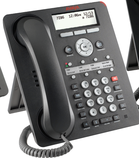
1608-I IP Deskphone