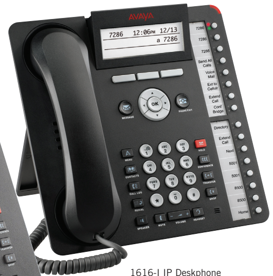
1616-I IP Deskphone